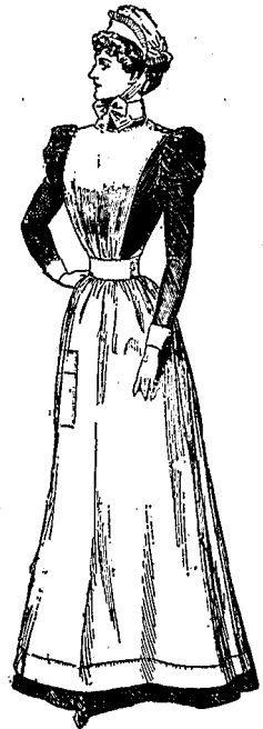
The "Rena" Apron. Made of linen finished Cloth lock-stitch throughout, 2/6 each. In two sizes, 36 in. & 39 in. from waist to hem.