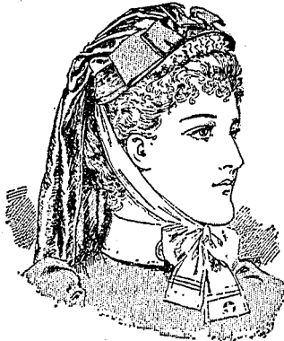
The "St. Bride's" Bonnet. Made of fine Straw with Lace and ruching, and trimmed with Ribbon, and long Silk Gossamer Fall. In black and colours, 12/6 each. Without Fall, 9/6; also The "St. Clare" Bonnet. 6/11 complete.