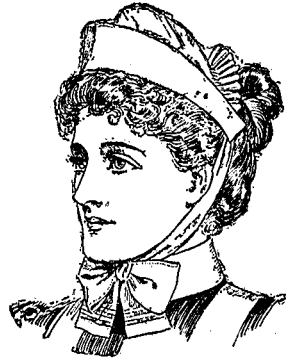
The New "Sister Dora" Cap. Made of washing Cambric, with draw strings. Can be washed as easily as a handkerchief. 1/-. Without strings, 10½d.